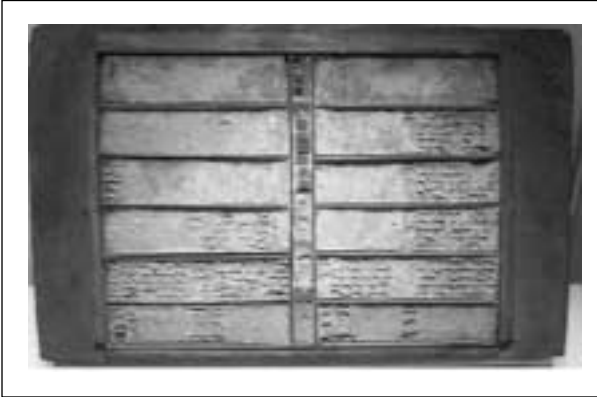
Figure 4 Wooden plate for publication of jokbo from the 20th century

Continued publication of wooden type jokbo , especially in the 1920s when the number of titles published was the highest, was the result of maintaining the traditional method befitting the special subject of jokbo and the use of the already existing wooden type. This trend continued until the mid-1930s, but beginning in the late 1930's the advantages of the wooden type edition could not exceed the economics and the convenience of new printing technology. Instead of manufacturing with the wooden type, it was more advantageous to use already commonly used new printing technology. This is confirmed by the decreasing number of jokbo printed by wooden type and to the contrary, the highest number of jokbo printed using new lead metallic type or lithography in the late 1930s.