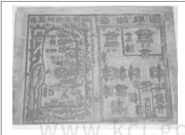
Figure 5 Wood plate for dopyo (figures) and picture of the progenitor's tomb