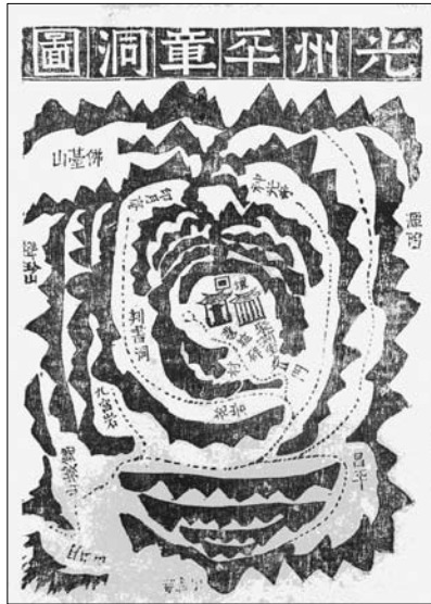
Figure 2 Geomantic Map of an Ancestral Graveyard by Geomancy of Tomb (Collection of the Seoul Museum of History)