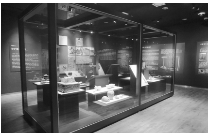
Figure 7. Installation at the Exhibition “Treasures from the Geumgangsa Temple Site in Yeongju” at Daegu National Museum

Daegu National Museum presented another small yet impressive exhibition, entitled the “Treasures from the Geumgangsa Temple Site in Yeongju” that welcomed visitors from October 23, 2018 to February 24, 2019. The exhibition