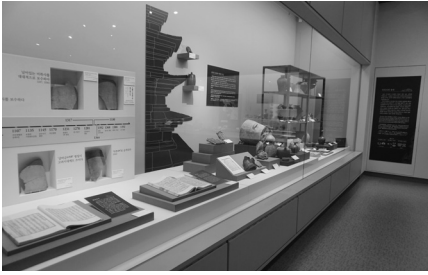
Figure 6. Installation at the Exhibition “Mireuksa Temple during the Goryeo Dynasty” at Mireuksaji National Museum

the celadon wares of Mireuksa Temple, Sajaam Cloister 獅子庵, and the reimagining of Mireuksa Temple. In the beginning part of the exhibition, the roof tiles bearing inscriptions of reign dates such as the “fifth year of Taping xingguo” (980), the “fourth year of Yanyou” (1317), or the “third year of Tianli” (1330) from the Mireuksa Temple Site were shown as evidence of construction