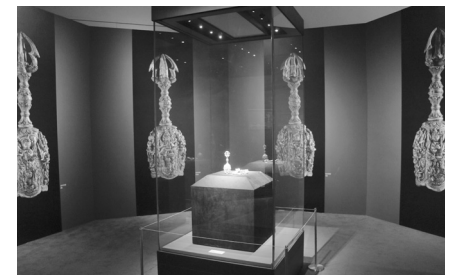
Figure 8. Installation at the Exhibition “Yeongguksa Temple and Dobongseowon Confucian Academy” at Seoul Baekje Museum

Another important exhibition, which shared the approach taken in the four exhibitions, is the “Yeongguksa Temple and Dobongseowon Confucian Academy,” held by Seoul Baekje Museum from March 3 to June 3, 2018 to mark the occasion likewise. 3 The exhibition was also grounded in archaeological finds dating from the Goryeo Dynasty, which were excavated in 2012 at the site of a Confucian academy of the Joseon Dynasty on Seoul’s Dobongsan Mountain. The excavation revealed that Dobongseowon Confucian Academy was constructed on the former site of a Goryeo temple, Yeongguksa 寧國寺, while yielding seventy-nine gilt bronze objects once used at the temple. They attracted fierce public attention because of their unlikely findspot and highly unusual iconography that adorn a set of vajra bell and vajra holder among the finds. Each of five sides that constitute the body of the vajra bell bears an image of one of the five dharma-guardians of the five dhyāni-buddhas. This is the sole example of these esoteric divinities that has come to light thus far. As such, the object was rightly brought into the spotlight as the center of the entire exhibition at Seoul Baekje Museum and was loaned to Cheongju National Museum and the National Museum of Korea for their special exhibitions held in 2018 (Figure. 8). Objects like this vajra bell