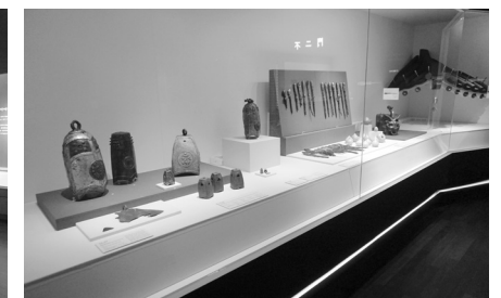
Figure 1. Installation at the Exhibition “Goryeo Temples in Central Korea: People and Prayers” at Cheongju National Museum