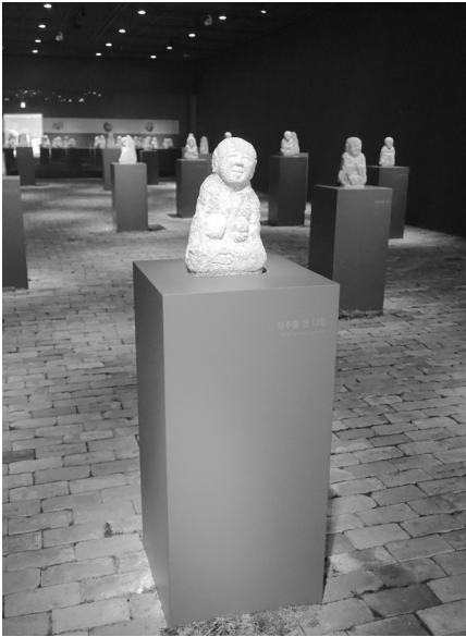
Figure 3. Installation at the Exhibition “Five Hundred Arhats from the Changnyeongsa Temple Site: Reflection of Our Hearts” at Chuncheon National Museum

or “knowing others’ sorrow” among others. Another artist Oh Yunseok’s 吳玠錫 sound installation enlivened the otherwise silent space with background sounds. The museum decided to put arhat statues on simple pedestals sparsely installed in the gallery, while making the entire space somewhat similar to a forest of arhats through collaboration with the two contemporary artists (Figure. 3). Each arhat statue was brought into the spotlight on a high pedestal rather than being shown as a constituent of the five hundred arhats. Visitors were naturally led to walk slowly around the arhats, which were arranged as if they were sitting in meditation in the forest, while