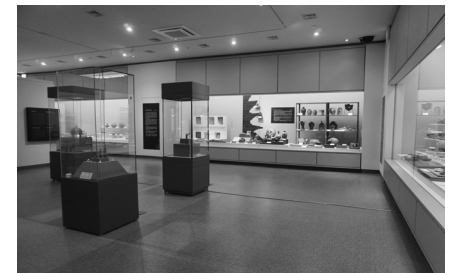
Figure 5. Installation at the Exhibition “Mireuksa Temple during the Goryeo Dynasty” at Mireuksaji National Museum

The exhibition was organized along themes of Mireuksa Temple in the Goryeo Dynasty, the revival of Mireuksa Temple and its appearance,